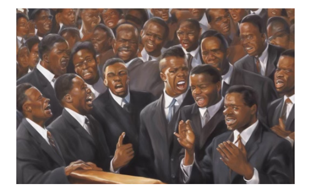
Chapter 3: The Anointing That Destroys Yokes

We need Holy Ghost and fire, tongue-talking preachers who can remove burdens and destroy yokes through the anointing.